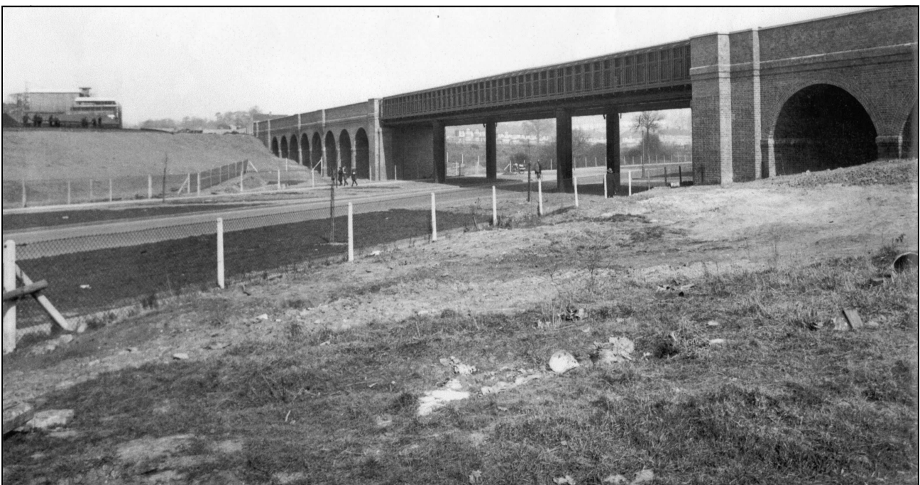
The Bridge carrying the Arnos Grove bound Piccadilly Line over Telford Road

The photograph was taken just after both the bridge and road were opened in 1932.