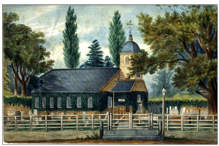
The Weld Chapel, demolished to make way for Christ Church Southgate