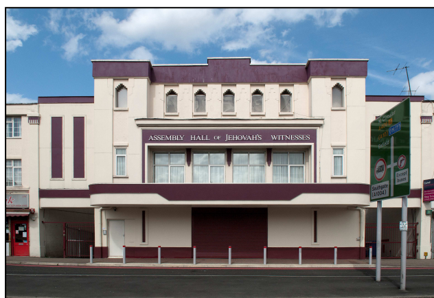
Ritz, Bowes Road (ABC)

Venue: Walker Lower Hall, Christ Church Parish Centre, 7 The Green, Southgate, N14