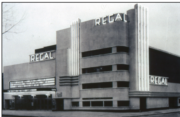
Regal, Old Kent Road