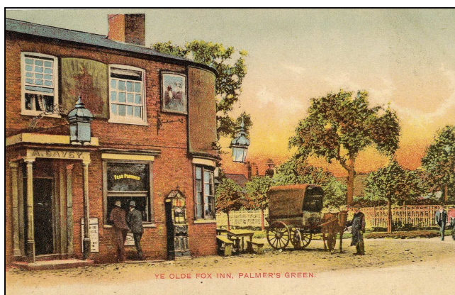
The Fox 1900

The Civic Voice workshop, attended by members, gave us lots of good advice. As well as access to their expert team during our planning.