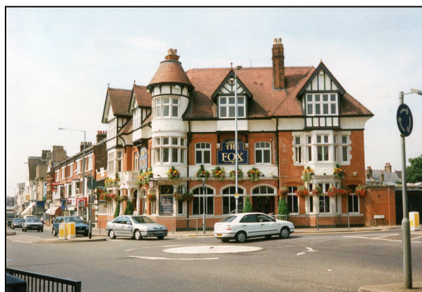
The Fox 1996