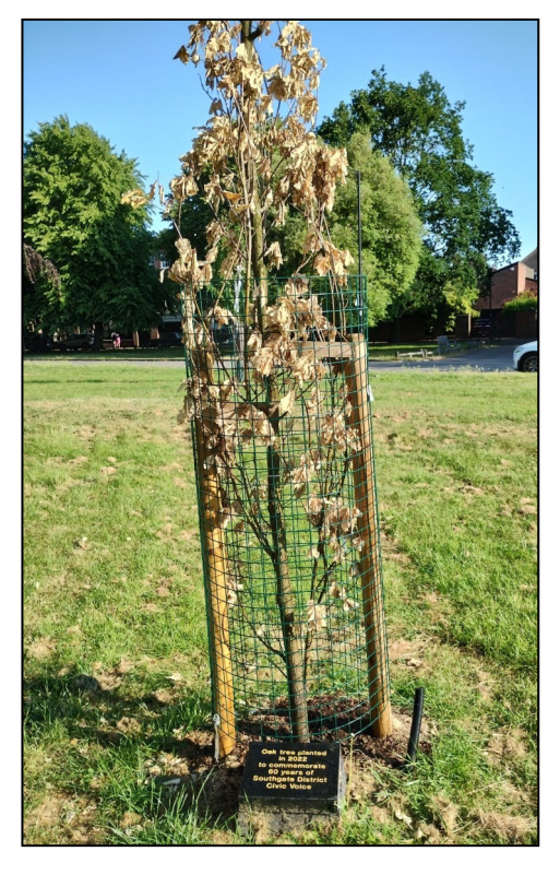
The tree wilting in June 2023

The council had committed to watering it once or twice a week, but by the end of May the hot dry weather had affected the tree badly and it was looking shriveled. Regular watering was done by members and others to try to revive it, but it's showing no signs of life again yet. We have been advised to continue watering it through the summer and if there is still no improvement we will ask the council to replace it, which is what they promised if it failed.